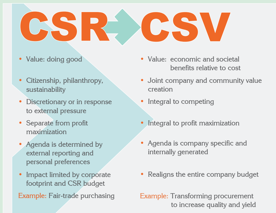
Figure 1. Corporate Social Responsibility (CSR) vs. Creating Shared Value (CSV). (Adapted from Porter and Kramer, 2011).

Creating shared value represents a break from the traditional notion of corporate social responsibility – a means by which companies “give back” profits to society through social services. Unlike corporate philanthropy, the shared value concept does not reflect the personal values of a company’s management but rather is concerned with the creation of economic value from social value.